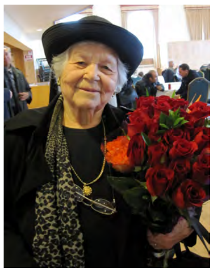
"Heartfelt gratitude to all, who organized and congratulated me for my 90 year Birthday. Let the Merciful God strengthen our

LET THE DEED OF THE HOLY BROTHERS STANDS FOR CENTURIES!